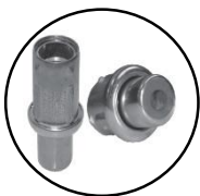
ADJUSTABLE FOOT INSERT

Worktable Type: S = Square S FL = Corner table left splash S FR = Corner table right splash